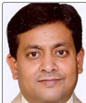
Dr. Mumtaz Ansari Centre Zone